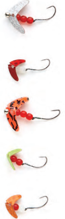
Same setup with a 0.8- to 1.1-inch Mack's Lures Smile Blade.