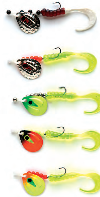
12-pound Berkley Trilene XT line, #3 JB Lures Ventilator Blade, #4 Gamakatsu Walleye Wide Gap Hook with 2-inch Berkley PowerBait Grub—rig length 36 inches.