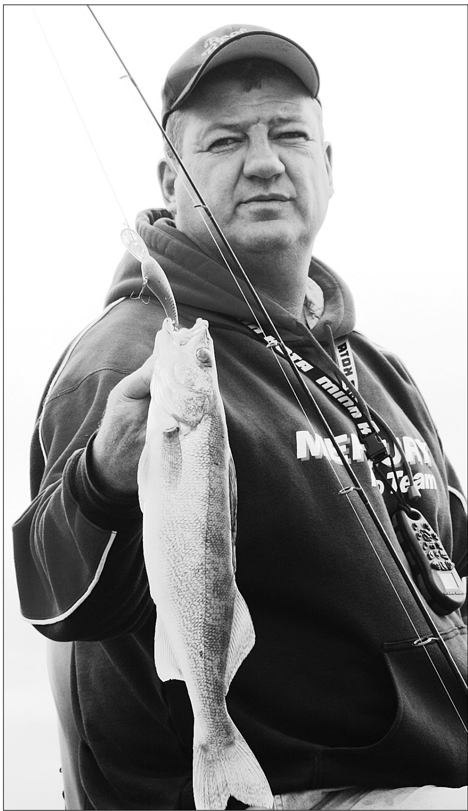
Another typically aggressive, shallow water, summer walleye falls prey to a cast crankbait.

For those fish that refuse to give in so easily, we can deploy a dead-stick method of dragging live bait in a subtle and seductive manner to cover the exact same ground while we are casting. Simply pinch on a small split shot directly ahead of a snap swivel and leader with a float and a feather light Mack's Lure Smile Blade baited with either leeches or